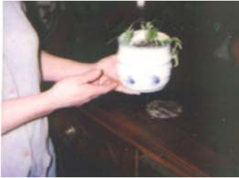
White Water Marks?