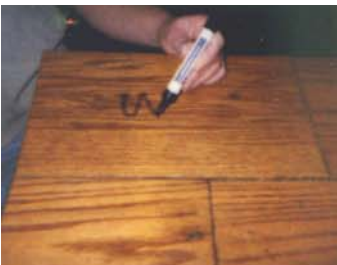
Magic Marker & Ink Stains?